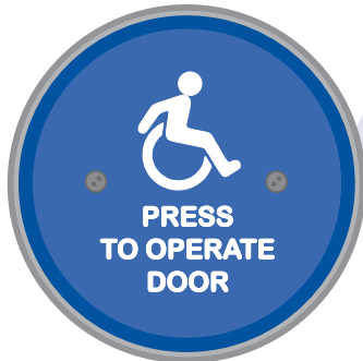
#59R6-H (Blue Background with White Legend)