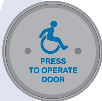
#59R6-HSS (Stainless Steel with Blue Legend)