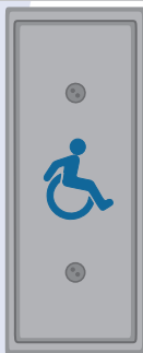
#59J-WSS (Stainless Steel with Blue Legend)