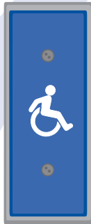
#59J-W (Blue Background with White Legend)