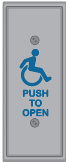
#59J-HSS (Stainless Steel with Blue Legend)