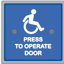
#59-H (Blue Background with White Legend)