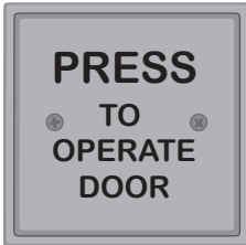
#59-P (Stainless Steel with Black Legend)