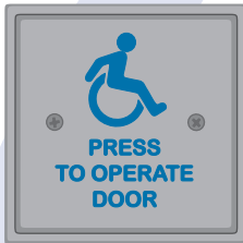
#59-HSS (Stainless Steel with Blue Legend)