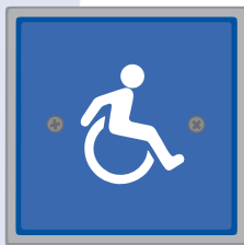
#59-W (Blue Background with White Legend)