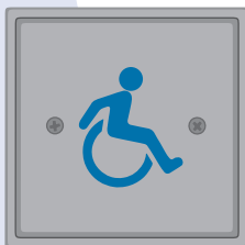
#59-WSS (Stainless Steel with Blue Legend)