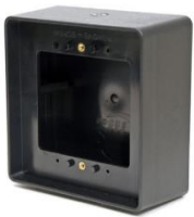
1015 SURFACE BOX