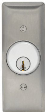
#830-N (1 11/16" x 4 1/2" Face Plate)