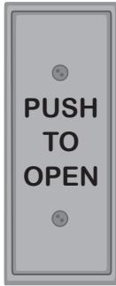
#59J-P (Stainless Steel with Black Paint Filled Legend)