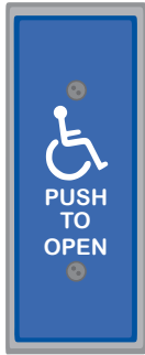
#59J-H (Blue Powder Coat with White Paint Filled Legend)