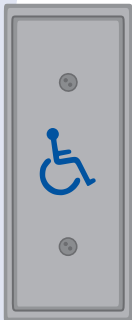
#59J-WSS (Stainless Steel with Blue Paint Filled Legend)