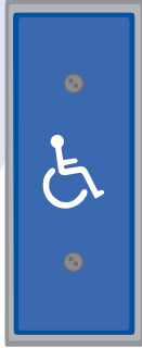
#59J-W (Blue Powder Coat with White Paint Filled Legend)