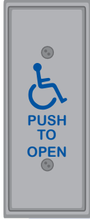
#59J-HSS (Stainless Steel with Blue Paint Filled Legend)