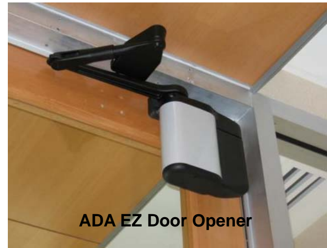
ADA EZ Door Opener