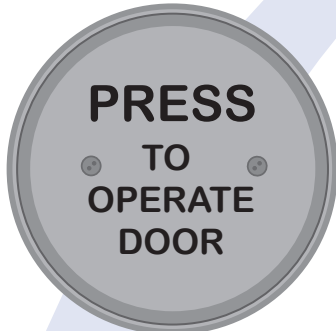
#59R6-P (Stainless Steel with Black Paint Filled Legend)