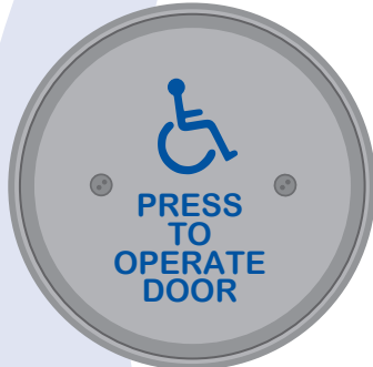
#59R6-HSS (Stainless Steel with Blue Paint Filled Legend)