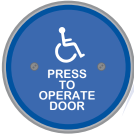
#59R4-H (Blue Powder Coat with White Paint Filled Legend)