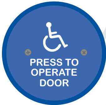
#99-H (Blue Powder Coat with Engraved Legend)