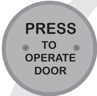
#99-P (Stainless Steel with Black Paint Filled Legend)