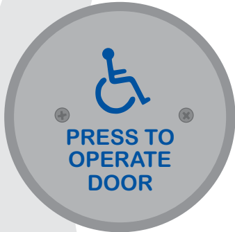
#99-HSS (Stainless Steel with Blue Paint Filled Legend)