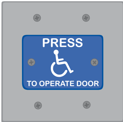
#1078-H (Anodized Blue Aluminum Face Plate with Engraved Legend)