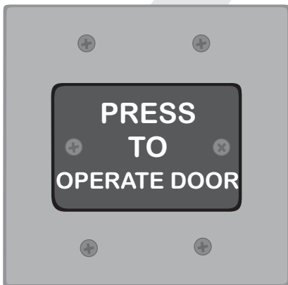
#1078-P (Anodized Black Aluminum Face Plate with Engraved Legend)